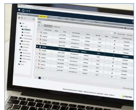
Imprima VDR Platform